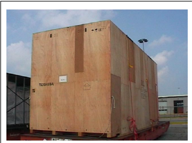
Port Rotterdam (2001.8.24)