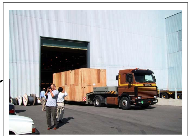
CERN B180 (2001.9.3)