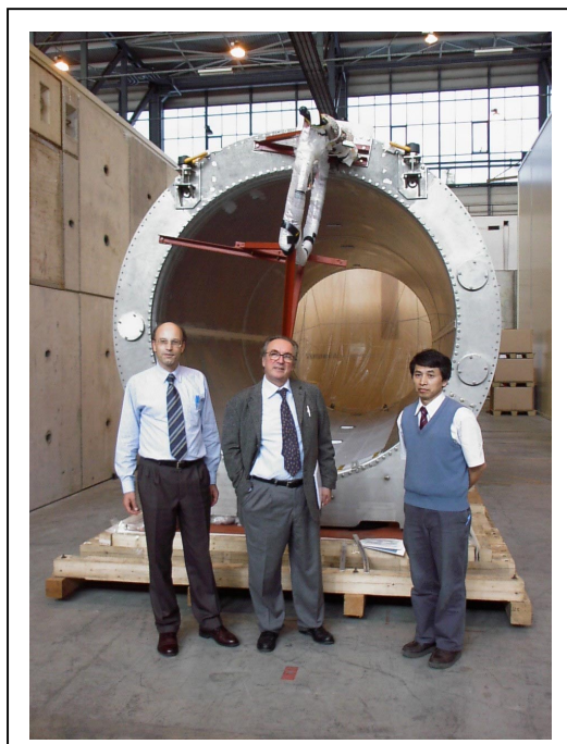
Acceptance test (2001.9.28 – 10.3)